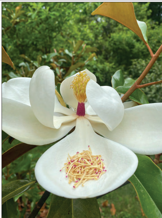
Magnolia grandiflora "Bracken's Brown Beauty" at Hortus Arboretum Botanical Garden.

array of topics every Saturday, and there are free acoustic concerts in the garden